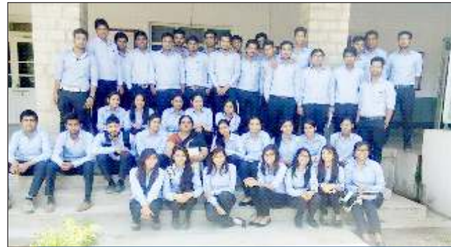
Visit to Zonal Railway Training Institute for MBA (FSM) Students