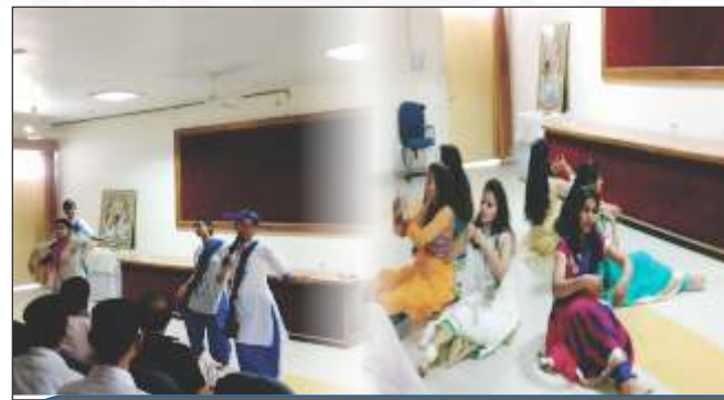
Students performing in Cultural Events