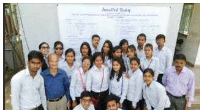
Visit to AMUL Plant for MBA (CMAT) Students