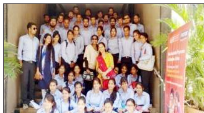
An Industrial Visit to NISM and IMAGICA organized for FSM Students